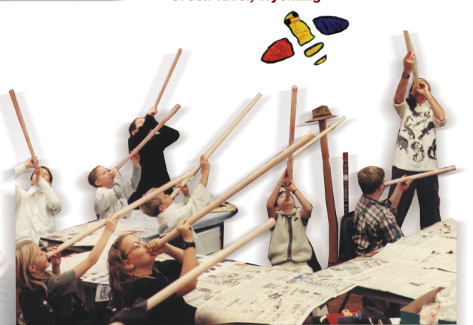
Park Elem. Casper, WY