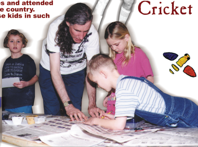
Urie Elem. Lyman, WY