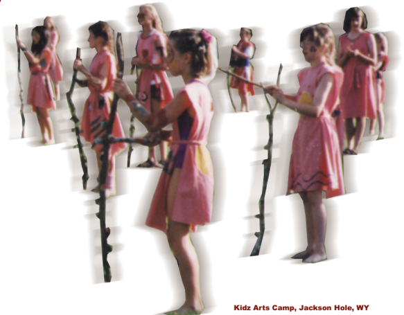
Kidz Arts Camp, Jackson Hole, WY